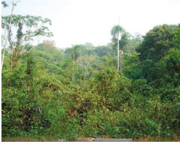
New growth. When cleared land is left alone, secondary forests like this one in Mato Grosso, Brazil, can take hold.

Most of the research on secondary forests has been done in Costa Rica and other Mesoamerican countries, where original forests were mostly converted to agriculture decades ago. Patches of that land have slowly reverted to forests, whereas the remainder remains in cultivation. Such studies have