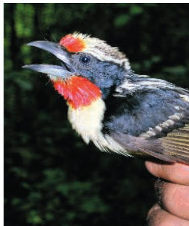
Different fates. The harlequin toad is one of many species that require old-growth forest, whereas the black-spotted barbet can survive in regenerating forest.