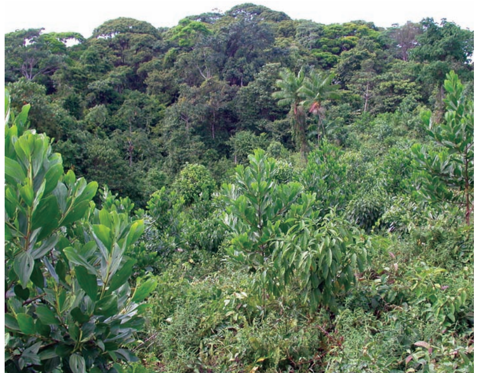
Fig. 2. A commercial restoration plantation in northeastern Costa Rica. In the foreground are planted individuals of Acacia mangium , a fast-growing tree species native to Asia and Australia, which tolerates poor soils. A fast-growing native species, Vochysia guatemalensis is also planted here among the A. mangium trees. In the background is a fragment of 25-year-old secondary forest. Euterpe oleracea , an exotic palm species from Brazil that was cultivated in a nearby plantation has colonized the restoration site (upper right quadrant) and is now invading secondary forests in this area.